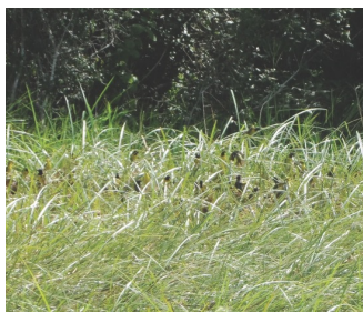
A Clarke's Weaver breeding site in Dakatcha Woodland.