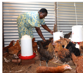
A poultry farmer in Yala.