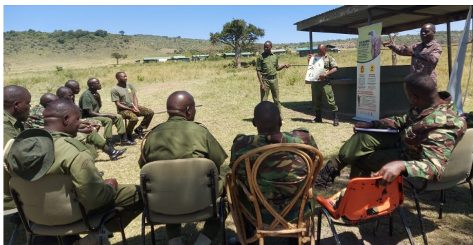
Rapid response to wildlife poisoning protocol training for community conservancy rangers in Maasai Mara.