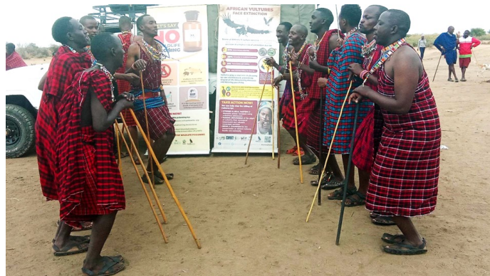
A vulture conservation awareness outreach in Mara.