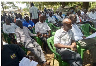
Community engagement at a policy formulation forum.