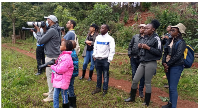
A past Wednesday morning bird walk.