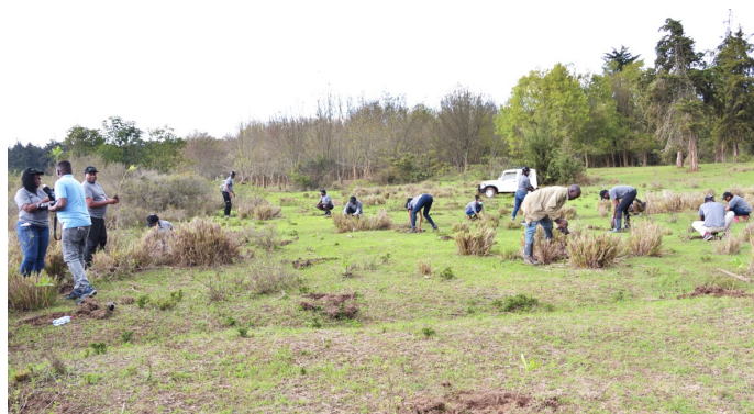
Tree planting engagement with Kenya Breweries Limited in Hombu Forest.