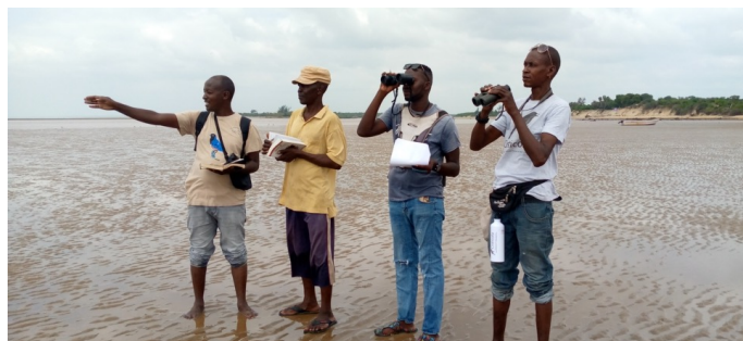
Bird monitoring at the Tana River Delta.