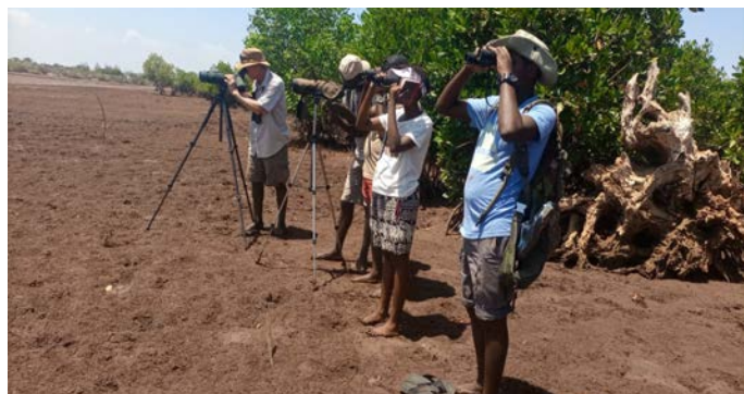
Site monitoring at Mida Creek.