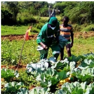
A climate-smart agriculture beneficiary.