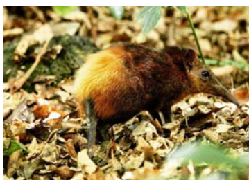
A Golden-rumped Sengi (elephant shrew) in Arabuko-Sokoke.