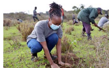
Tree planting in Mt. Kenya.