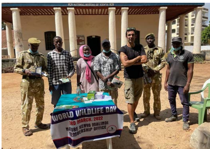
A past Malindi Membership Office event.