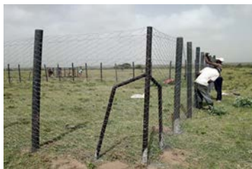
Construction of a predator-proof boma.