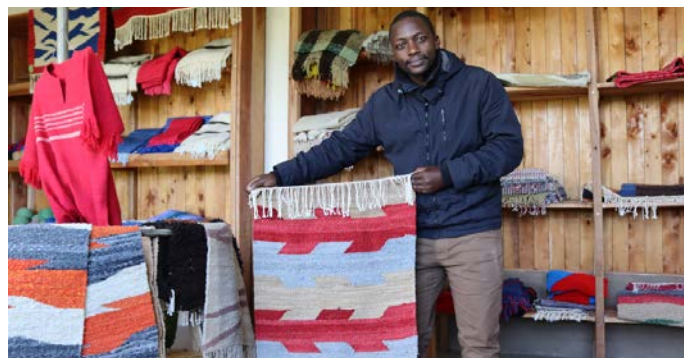
Wool spinning products by the Friends of Kinangop Plateau SSG.