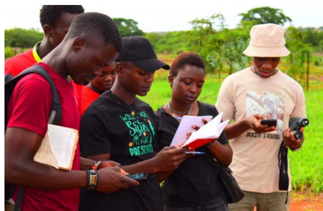
Bird watchers in Voi participating in the May Global Big Day.