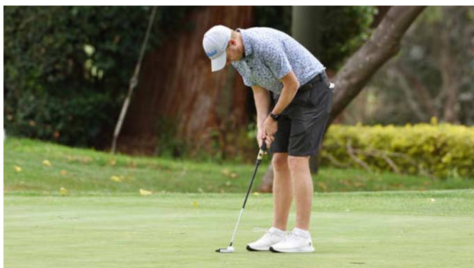
Part of the action during the 2023 charity golf tournament.