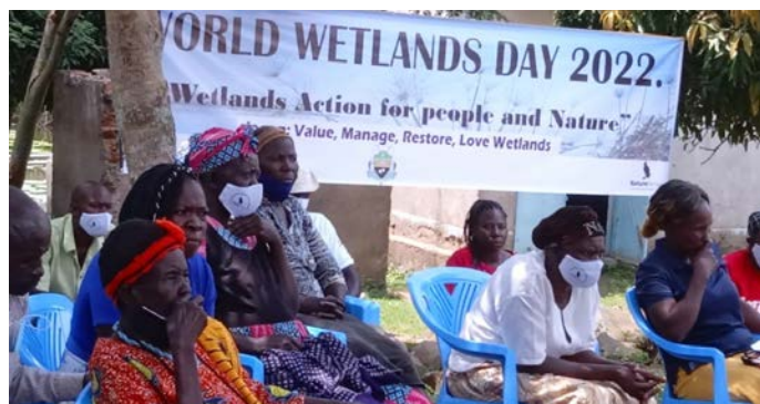
Marking of the World Wetlands Day in Yala, Siaya County.