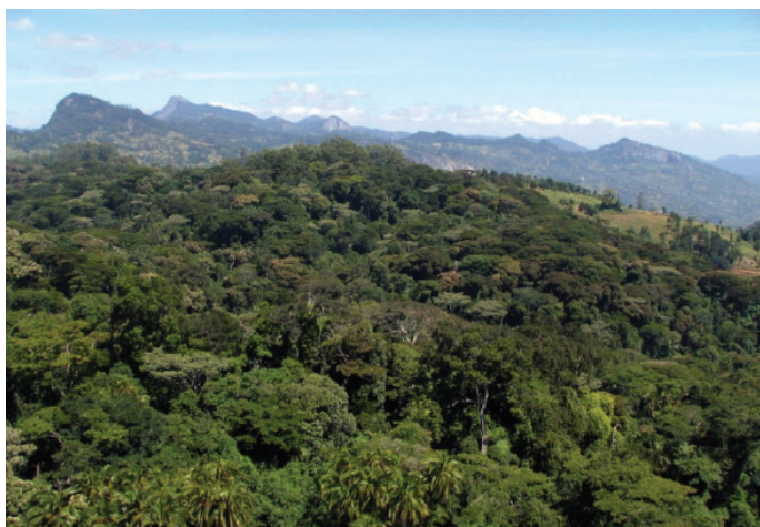
A section of the Taita Hills forests.