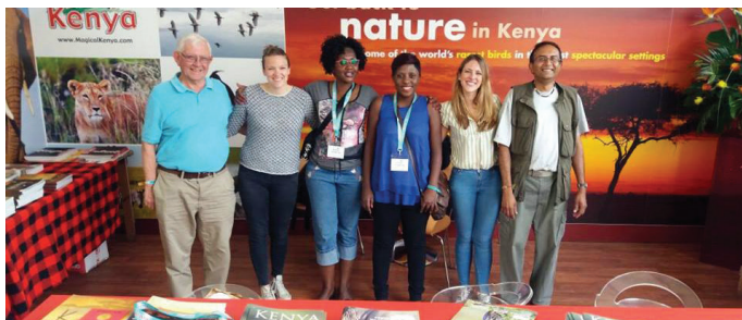
The Kenya Birding stand at the UK Birdfair 2016.