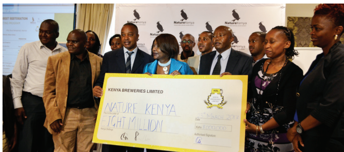
Presentation of the Ksh 10 million cheque by Kenya Breweries Limited for Mt. Kenya forest rehabilitation.