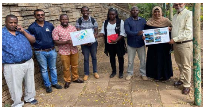
FOCP, KHS and City Park management during officiating and launch of fishpond area refurbishment.

friendsofcitypark.org f Foep.raiki @cityparkfriends 713130005 cityparkfriends@naturekenya.org