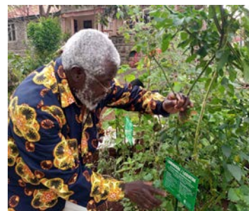
A study at TICA Herbal Garden.