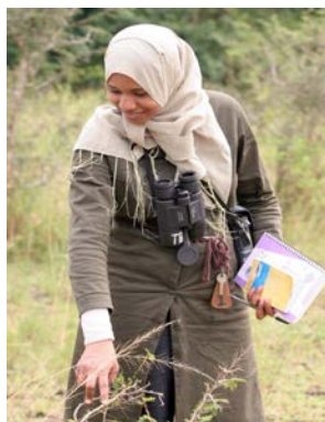
A field course student.

Contacts: tba-Africa@tropical-biology.org