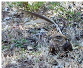
Pennant-winged Nightjar at Ngong Road Forest Sanctuary.