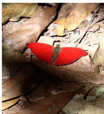
Red Glider at Kakamega Forest.