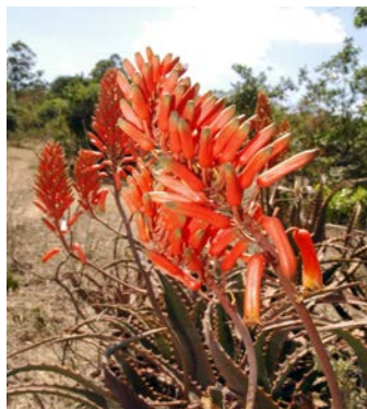
Aloe ngongensis , a regional endemic species, which was first described from the Ngong ecosystem.

Contacts: botany@museums.or.ke or office@naturekenya.org or Twitter: @EAHerbarium NMK