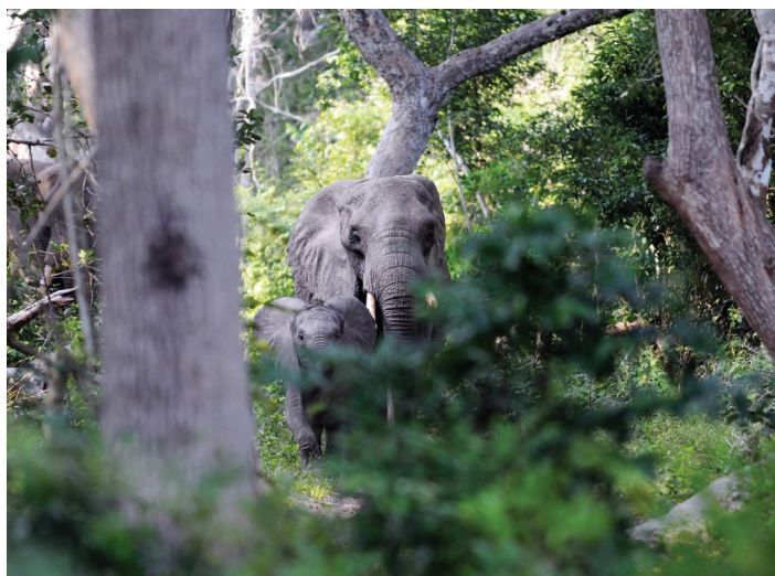
Elephants in Arabuko-Sokoke Forest. The forest is an important habitat for many wild animals, including elephants.

To further the conservation actions, a biodiversity survey in the neighbouring Kaya Mtswakara was recommended. This will support the delineating the Kaya as a new KBA, or extending the current KBA boundary to include the two Kaya forests as one KBA. Nature Kenya looks forward to directly engaging the local community in the area to enhance their capacity to continue safeguarding this invaluable relict as its custodians. 🌿