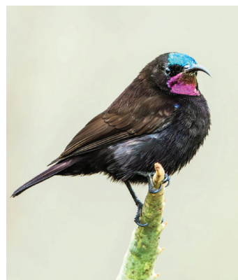
Amethyst and Scarlet-chested sunbirds