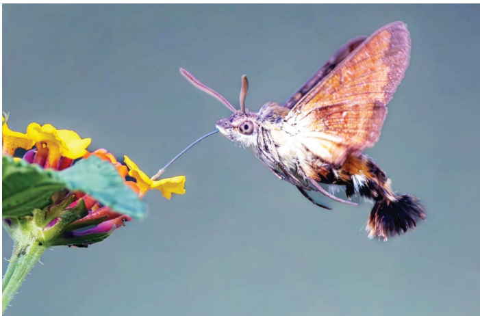
African hummingbird hawk-moth

A pictorial by Simon Odhiambo @Kenyanbirder