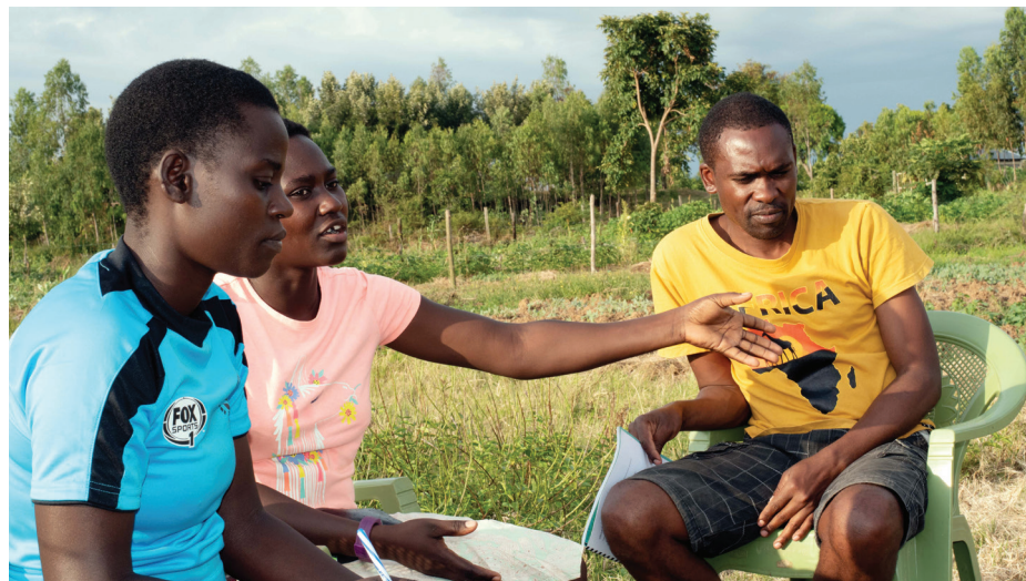
Members of the Kanyibok Youth Group having a discussion at their farm.