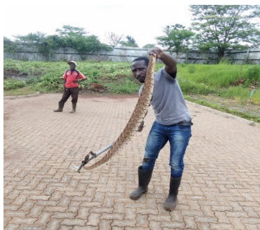
Puff adder at Kuraiha waterfront.

Contact: khwginfo@gmail.com / office@naturekenya.org