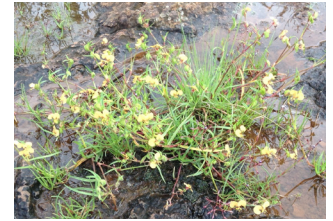
Commelina purpurea .