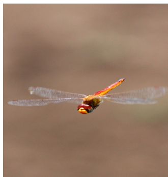
Globe Skimmer ( Pantala flavescens )