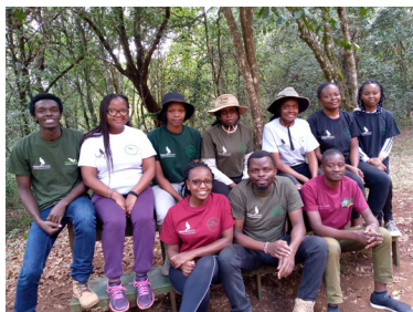
Camping at Ololua Forest.

Contact: khwginfo@gmail.com / office@naturekenya.org