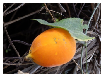
Mormodica calantha , a new plant record for NMK compound.

Contacts: botany@museums.or.ke or office@naturekenya.org