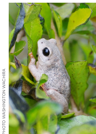
Common Reed frog