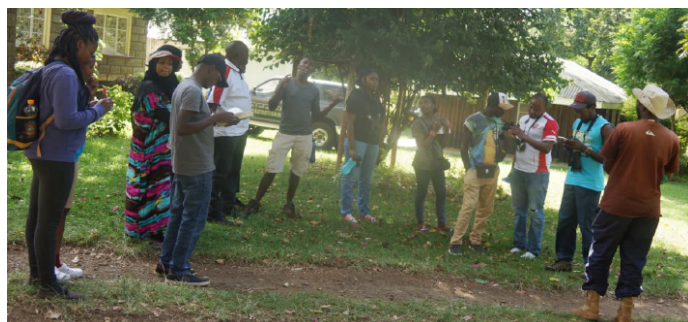
Youth Committee members at Rhino venture campsite.